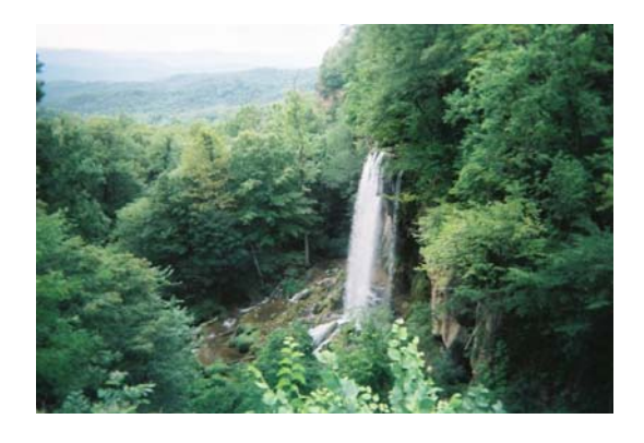
View of the Falling Spring Falls