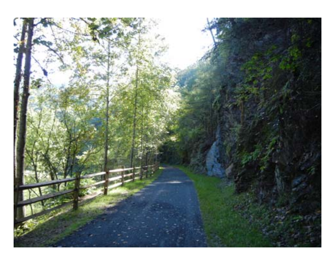
Jackson River Scenic Trail

This pamphlet was prepared as a public service by the Alleghany County Board of Supervisors. Additional copies may be obtained from the Office of the County Administrator.